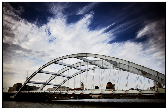
Frederick Douglass/Susan B. Anthony Bridge