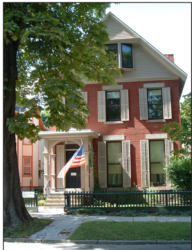
Come and see this this National Historic Landmark, the place Susan B Anthony called home during the most politically active period of her life.

The NeMLA Convention will be downtown at the Hyatt Regency Rochester and the Rochester Convention Center. Events with transportation will be planned to help you make the most of your stay. For more information on Rochester: www.VisitRochester.com .