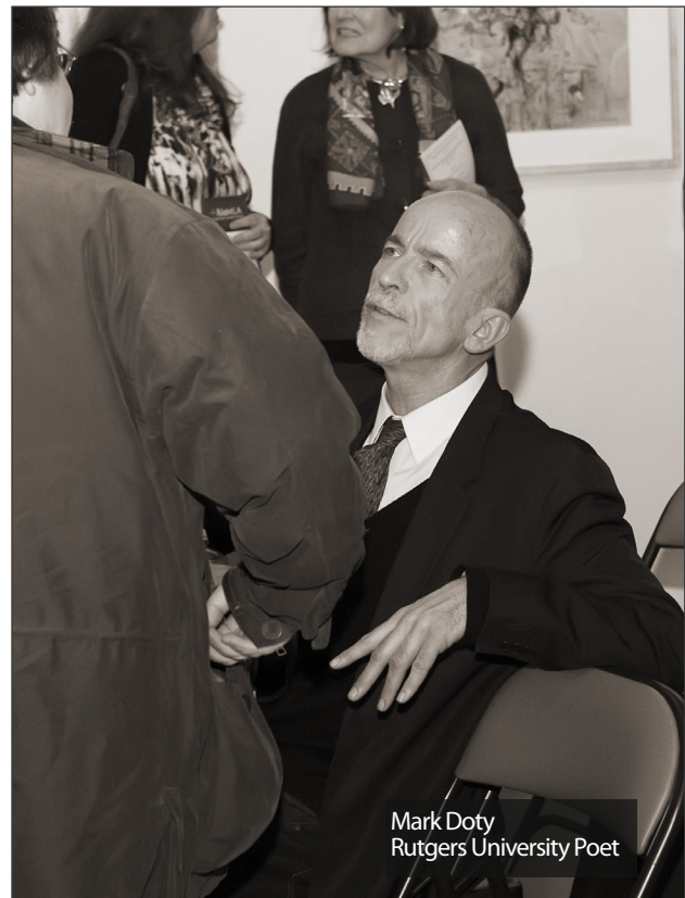
Mark Doty Rutgers University Poet

Virgin Envy (Seminar) This seminar aims to work through the poetics and politics of virginity in narrative, poetry, cinema, and popular culture and virginity as an interdisciplinary matter moving beyond the Virgin Mary and the Virgin of Guadalupe. Papers departing from literary and