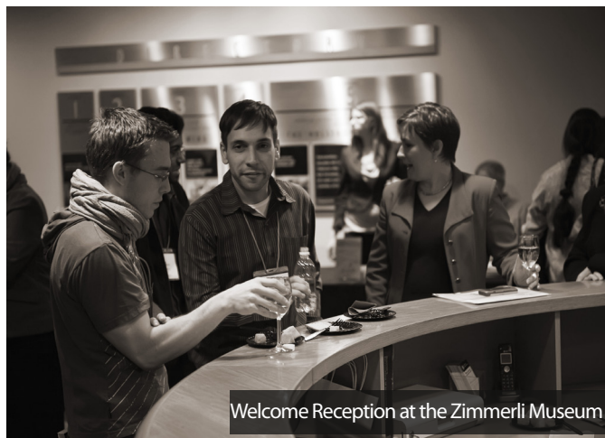
Welcome Reception at the Zimmerli Museum