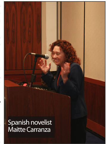
Spanish novelist Maitte Carranza

Re-visioning: Isn't There Already a Film Version of this Book? Television and comics serials get 'rebooted' and filmic versions of classics pile up in seemingly endless succession. Re-adaptations must acknowledge the visual heritage of the adaptations that came before them, while also asserting some sort of uniqueness - a return to the source text or a resituating in time and space: an 'update.' This panel will interrogate the need for such re-imaginings. What makes a character or world ripe for re-envisioning, and what shapes the way that re-envisioning occurs? 300-word abstracts to emily.lauer@gmail.com.