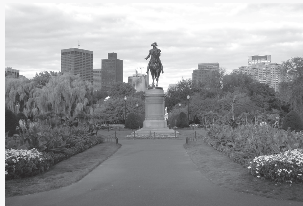
Boston Public Garden

**Please book early: the deadline for NeMLA's discounted rates is January 19, 2009.**