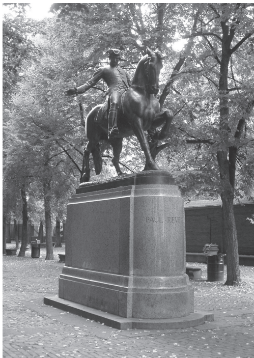
See the Statue of Paul Revere in the North End

A truly comprehensive sightseeing tour of Boston. The City View Trolley offers you a two-hour narrated tour of Boston's historic Freedom Trail and related sites. You can hop on and off at your leisure to get a closer look at sights. This tour has something for everyone! Stops include: Boston Common, The Old State House, The Granary Burying Ground, the Site of the Boston Massacre, and Faneuil Hall. Time: 12 pm; Meet in lobby of the Hyatt Regency at 11:45 Fee: $24 per person. Reserve by 1/30.