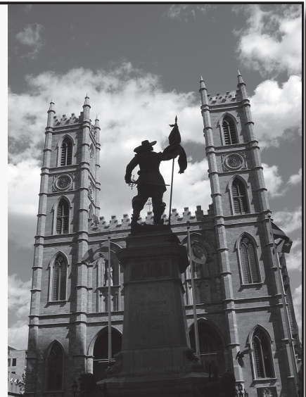
Basilique Notre-Dame de Montréal