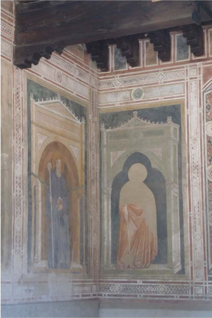
Fig. 4 Pomposa Chapterhouse, detail of Sts. Benedict and Peter

scene included, distinguishing it from the other decoration. The scene is prominently placed on the center of the wall opposite the entrance. The Crucifixion is flanked by windows, and beyond them, the figures of saints Peter (beyond the window to the left, in a somewhat ruined state) and Paul (to the right) (Fig. 4, 5).