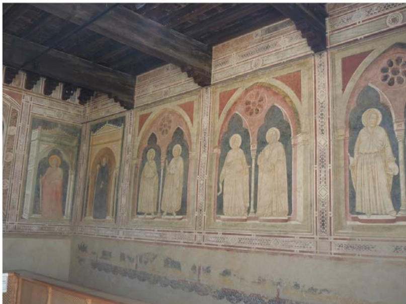
Fig. 3 Pomposa Chapterhouse, interior view towards right wall

The Chapterhouse was likely painted between 1310 and 1318. Most scholars agree that the Chapterhouse frescoes date, on stylistic grounds, to just slightly before those in the nearby Refectory, which are securely dated 1318 due to the presence of that date scratched into the arriccio , discovered when the frescoes were detached from the wall (Salmi 167-70). However, scholars have not agreed on the artist responsible. A long tradition, based on a now-lost inscription, ascribed the frescoes to Giotto (Salmi 152); twentieth-century scholars largely dismissed this attribution. Over the last century the paintings have been variously assigned to a number of artists, predominantly of the Riminese School. Hermann Beenken associated the frescoes with Pietro Cavallini (254). Mario Salmi connected them to an anonymous Romagnole follower of Giotto (167). The most recent scholarship favors the “Master of the Pomposa Chapterhouse” designation, acknowledging the lack of documentation and consensus (Volpe 126-31; Benati 158-65). This study shall follow that convention.