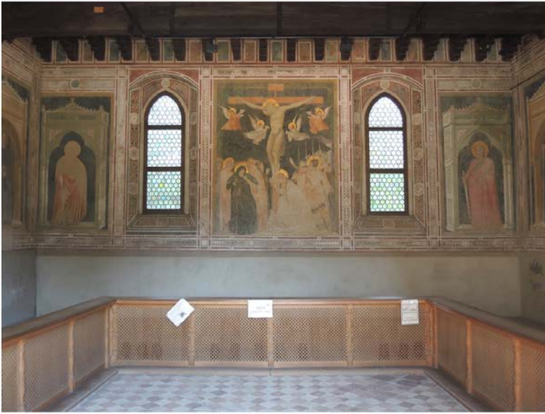
Fig. 1 Pomposa Chapterhouse, interior view facing crucifixion