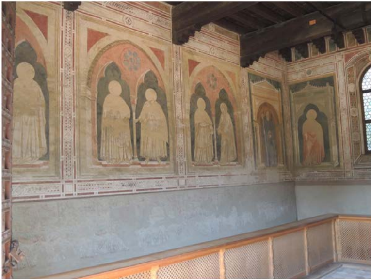
Fig. 2 Pomposa Chapterhouse, interior view towards left wall