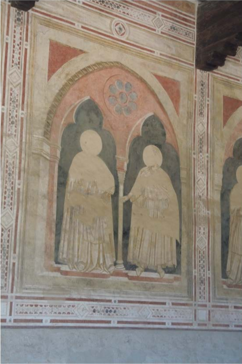
Fig. 6 Pomposa Chapterhouse, detail of prophets Ezekiel and Daniel

The remaining sections of the side walls depict twelve prophets, with three sets of paired figures on each wall (Figures 6, 7).