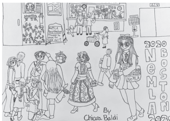
Drawing by Chiara Baldi

We encouraged our youngest attendees at our Boston convention to draw pictures inspired by what they saw at presentations and around the city. See more of their drawings at buffalo.edu/nemla/draws/